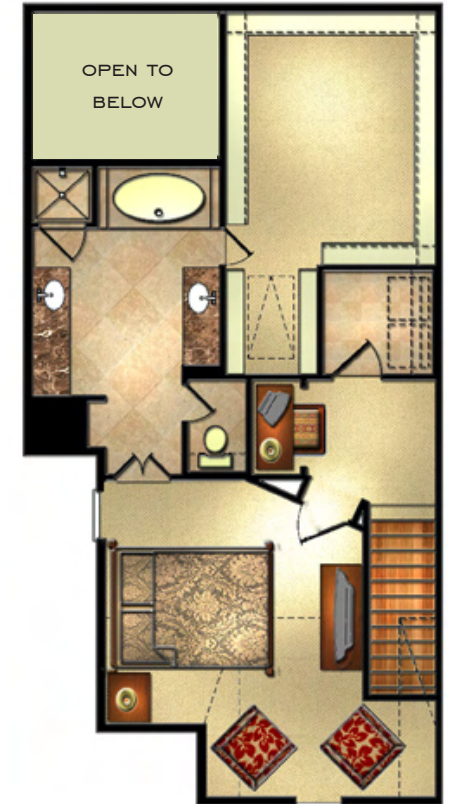
third FLOOR 781 square feet

LEXINGTON COMPANIES · 6688 N CENTRAL EXPWY · DALLAS TX 75206 · 214.369.4900 · LEXINGTONPARKPLANO.COM NO WARRANTY IS MADE, EXPRESS OR IMPLIED, AS TO DIMENSIONS OR SIZES; ALL ARE APPROXIMATE. FEATURES VARY AS EACH OF OUR RESIDENCES IS UNIQUE. SIZES, FEATURES, PLANS AND PRICES ARE SUBJECT TO CHANGE WITHOUT NOTICE.