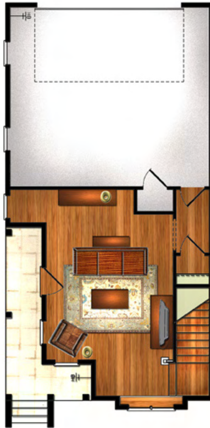
first FLOOR 432 square feet

CONTACT LEXINGTON FOR EXTRAORDINARY PURCHASE OPPORTUNITIES AT SALES@LEXINGTONCOMPANIES.COM 214.369.4900