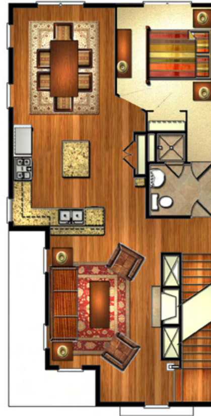
second FLOOR 913 square feet