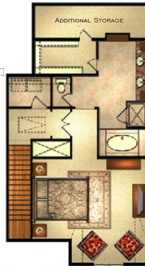
third FLOOR 856 square feet

LEXINGTON COMPANIES · 6688 N CENTRAL EXPWY · DALLAS TX 75206 · 214.369.4900 · LEXINGTONPARKPLANO.COM