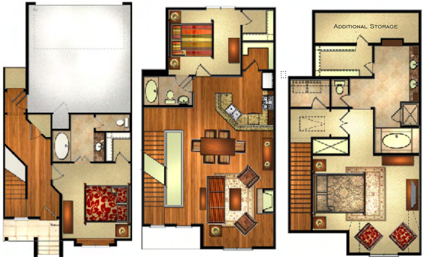
first FLOOR 534 square feet

CONTACT LEXINGTON FOR Extraordinary Purchase Opportunities at SALES@LEXINGTONCOMPANIES.COM 214.369.4900