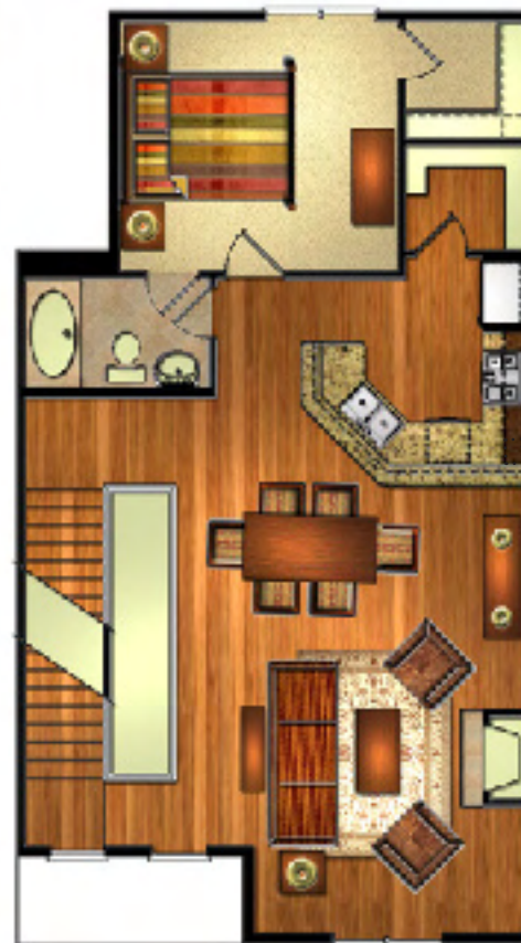
second FLOOR 962 square feet