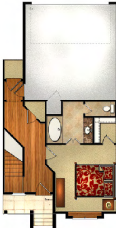
first FLOOR 534 square feet

CONTACT LEXINGTON FOR Extraordinary Purchase Opportunities at SALES@LEXINGTONCOMPANIES.COM 214.369.4900