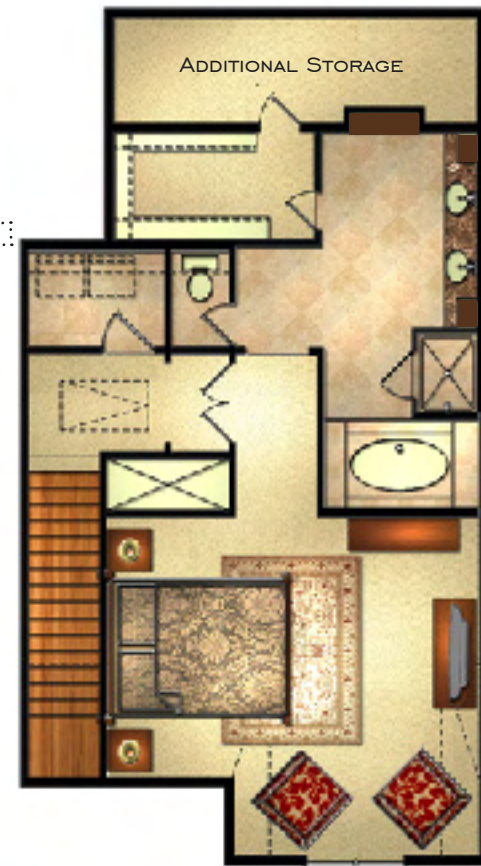
third FLOOR 856 square feet

LEXINGTON COMPANIES · 6688 N CENTRAL EXPWY · DALLAS TX 75206 · 214.369.4900 · LEXINGTONPARKPLANO.COM NO WARRANTY IS MADE, EXPRESS OR IMPLIED, AS TO DIMENSIONS OR SIZES; ALL ARE APPROXIMATE. FEATURES VARY AS EACH OF OUR RESIDENCES IS UNIQUE. SIZES, FEATURES, PLANS AND PRICES ARE SUBJECT TO CHANGE WITHOUT NOTICE.