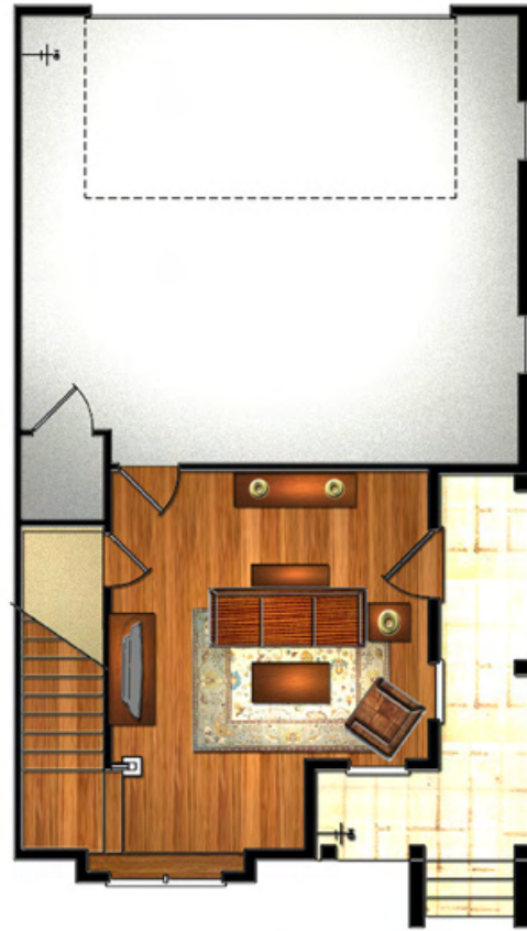
first FLOOR 297 square feet

CONTACT LEXINGTON FOR EXTRAORDINARY PURCHASE OPPORTUNITIES AT SALES@LEXINGTONCOMPANIES.COM 214.369.4900