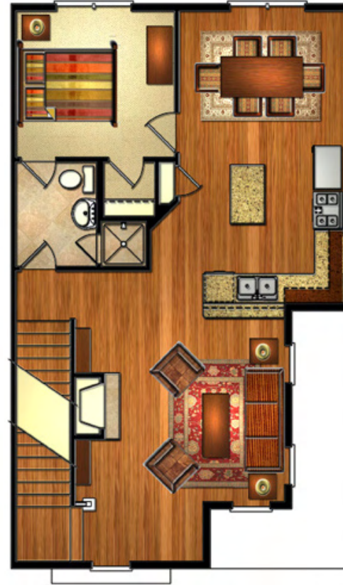
second FLOOR 783 square feet