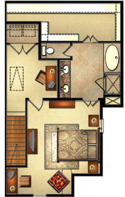
third FLOOR 783 square feet

LEXINGTON COMPANIES · 6688 N CENTRAL EXPWY · DALLAS TX 75206 · 214.369.4900 · LEXINGTONPARKPLANO.COM NO WARRANTY IS MADE, EXPRESS OR IMPLIED, AS TO DIMENSIONS OR SIZES; ALL ARE APPROXIMATE. FEATURES VARY AS EACH OF OUR RESIDENCES IS UNIQUE. SIZES, FEATURES, PLANS AND PRICES ARE SUBJECT TO CHANGE WITHOUT NOTICE.