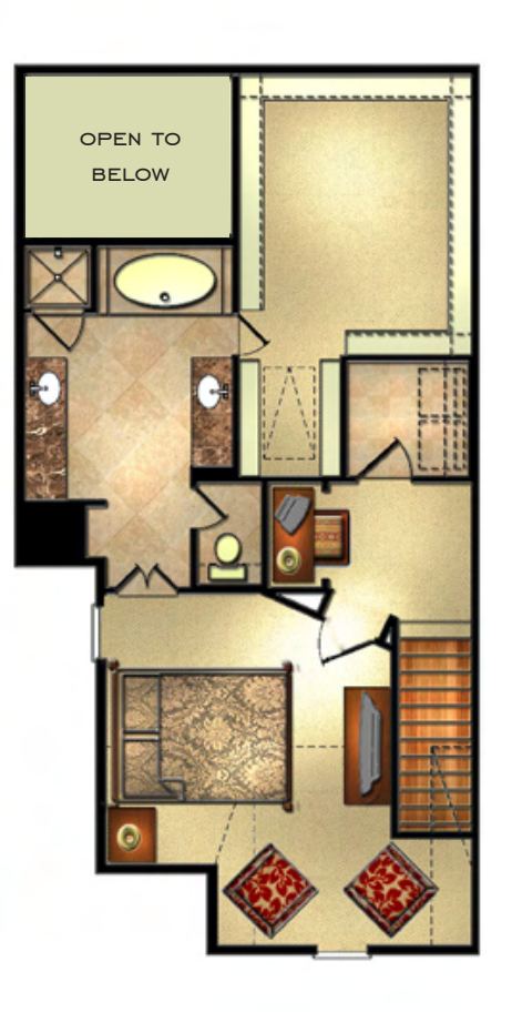
third FLOOR 781 square feet