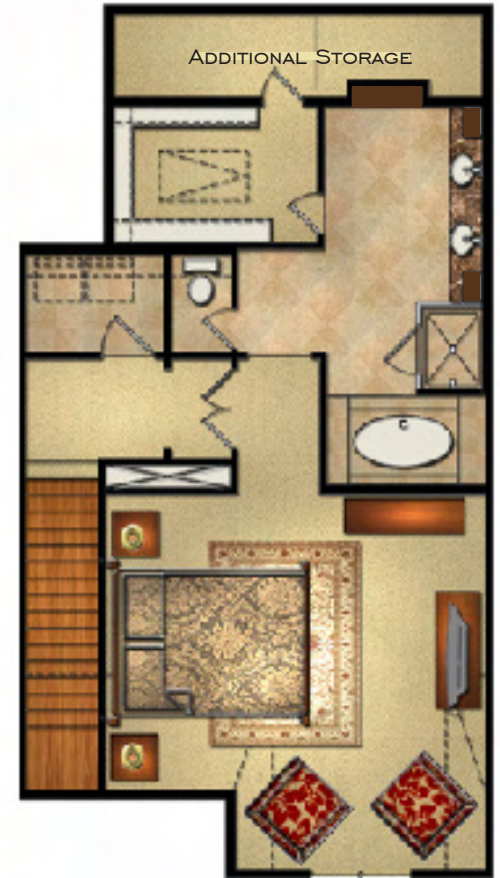
third FLOOR 832 square feet

LEXINGTON COMPANIES · 6688 N CENTRAL EXPWY · DALLAS TX 75206 · 214.369.4900 · LEXINGTONPARKPLANO.COM