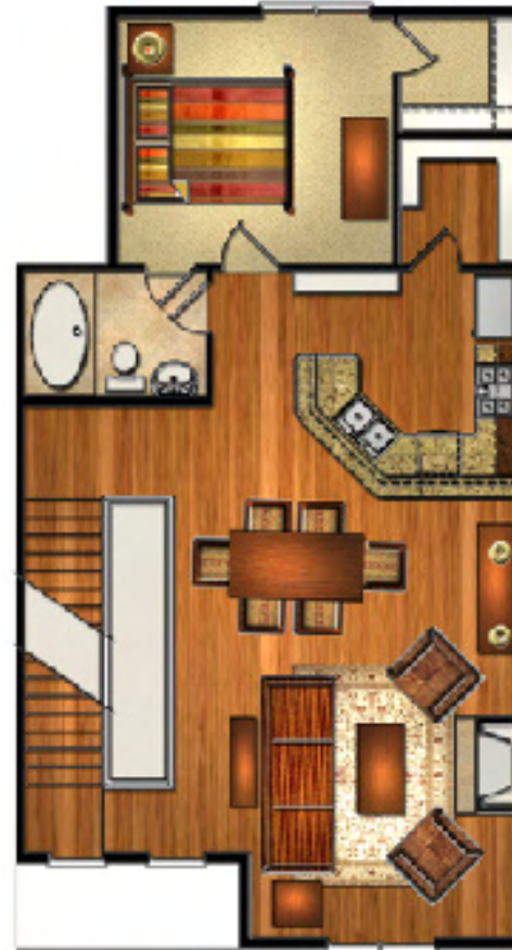
second FLOOR 938 square feet