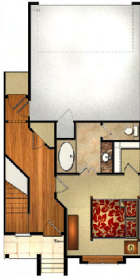
first FLOOR 510 square feet

CONTACT LEXINGTON FOR EXTRAORDINARY PURCHASE OPPORTUNITIES SALES@LEXINGTONCOMPANIES.COM 214.369.4900