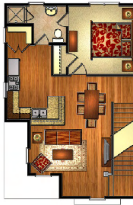
second FLOOR 714 square feet