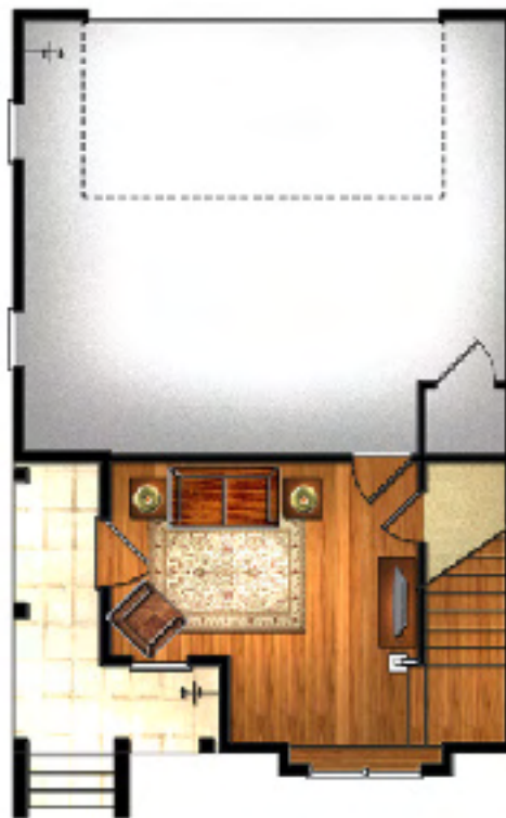
first FLOOR 231 square feet

CONTACT LEXINGTON FOR EXTRAORDINARY PURCHASE OPPORTUNITIES AT SALES@LEXINGTONCOMPANIES.COM 214.369.4900