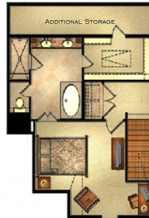
third FLOOR 714

LEXINGTON COMPANIES · 6688 N CENTRAL EXPWY · DALLAS TX 75206 · 214.369.4900 · LEXINGTONPARKPLANO.COM NO WARRANTY IS MADE, EXPRESS OR IMPLIED, AS TO DIMENSIONS OR SIZES; ALL ARE APPROXIMATE. FEATURES VARY AS EACH OF OUR RESIDENCES IS UNIQUE. SIZES, FEATURES, PLANS AND PRICES ARE SUBJECT TO CHANGE WITHOUT NOTICE.