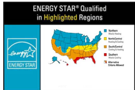
Sample ENERGY STAR Label for Products Qualified in All Climate Zones

To find energy-efficient windows and skylights, simply look for the ENERGY STAR. The ENERGY STAR guidelines for windows and skylights are tailored to four climate zones. For example, windows in the North are optimized to reduce heat loss in the winter, while windows in the South are optimized to reduce heat gain during the summer. This explains why windows that are energy efficient in Florida will not necessarily be energy efficient in Michigan.